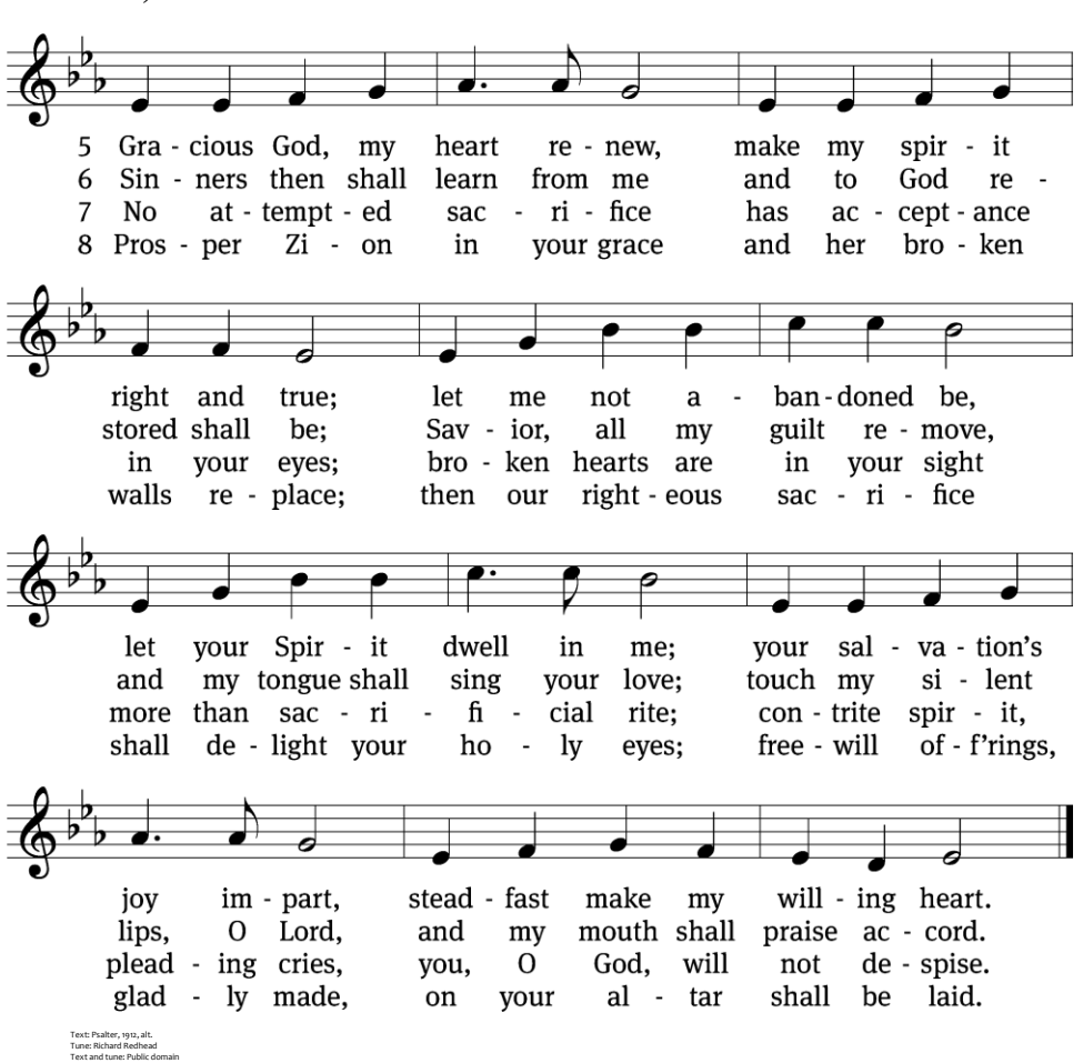
Silence for meditation