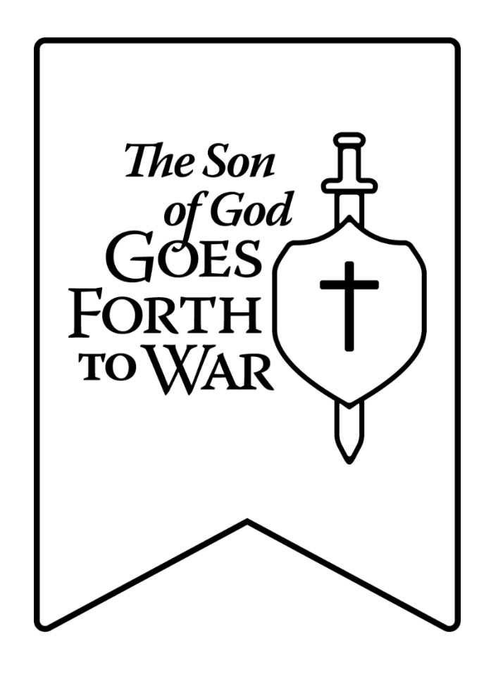
Ash Wednesday March 5, 2025 Abiding Word Evangelical Lutheran Church Maineville, Ohio